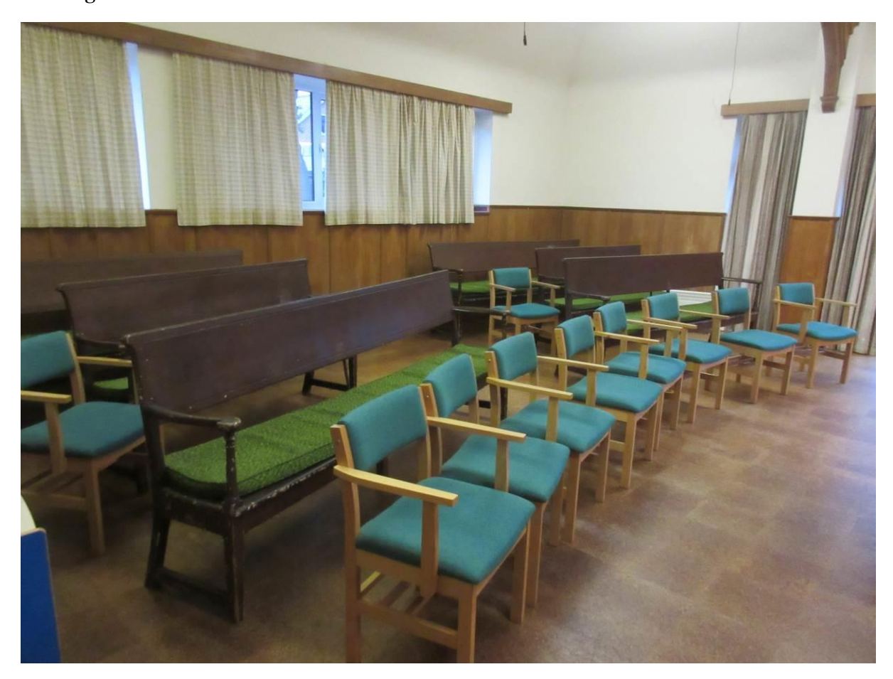
Figure 3: The seating in the meeting room includes old benches

There are some solid-backed benches (figure 3), presumably brought from the previous meeting house.